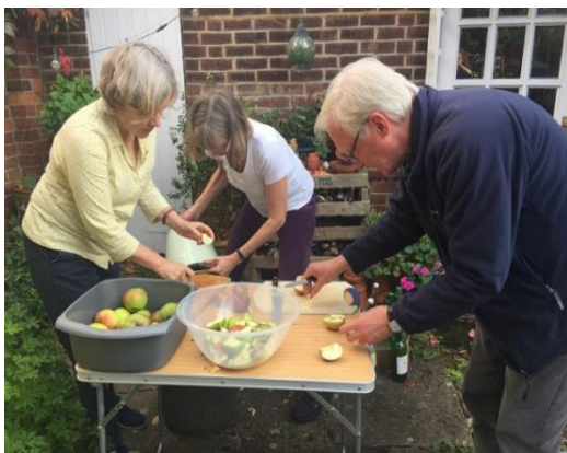
How to press apples in four easy (?) stages

Firstly, the ripe apples had to be checked to make sure there were no bad or badly bruised ones and then they were cored and chopped.