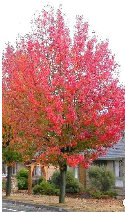
Ornamental pear tree - soon to be seen in Liphook Crescent