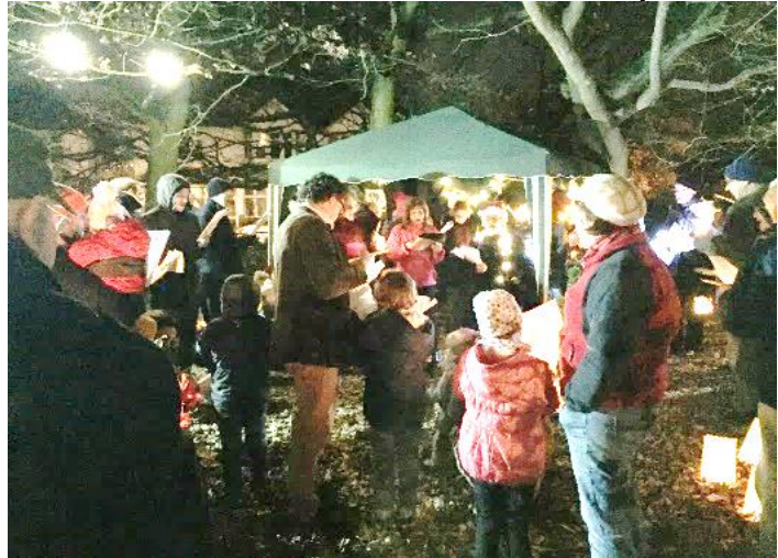
Carols by Candlelight 2016

So that is exactly what is happening! On Sunday 10th December, we will once again be gathering together to sing carols and other seasonal classics. The event will take place in the Triangle which will be festooned in festive style with fairy lights and candles. Mince pies and mulled wine will, of course, be provided.